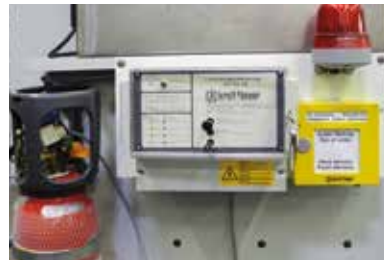
CO<sub>2</sub> fire extinguisher for working with cutting oil