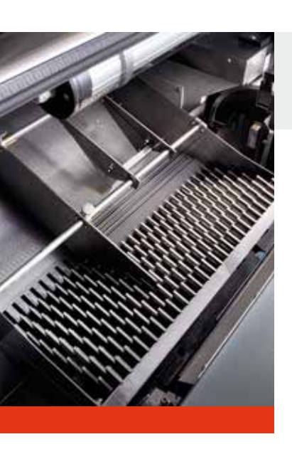
Separating conveyor loader (option)