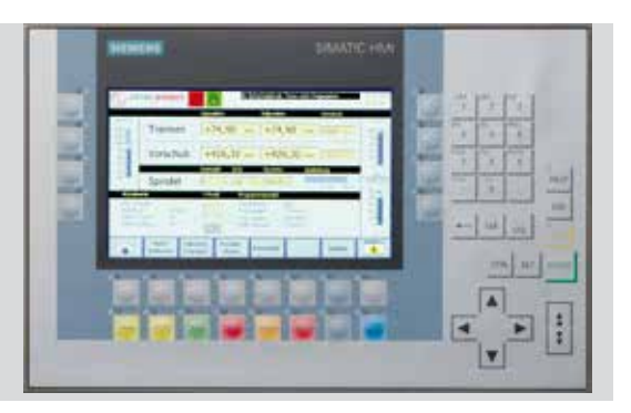
FT 200 commanding panel