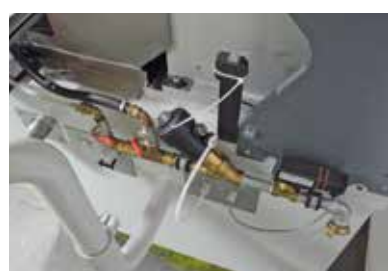
for connection to a central coolant supply