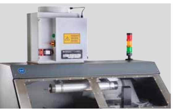
Oil mist extraction

The modern Siemens CN (TIA port with Sinamic drives) allows to program up to 5 different lengths for each rod with different lengths and quantities. This ensures the best possible usage of your blanks. The programmed data can be saved. The CN is easily programmable with graphical assistance and explicit help menus. The CN commands are converted into movements through servo drives and guarantee a very high positioning accuracy thanks also to high precision linear guides and ball screws.