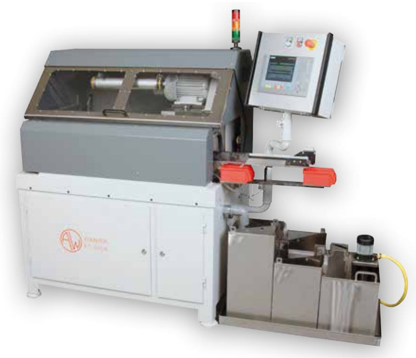
with a pump and 5 decantation vaults