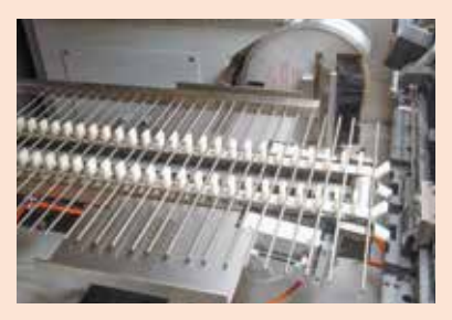
• for small sizes down to 1 mm