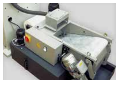
• for working with a paper filtration