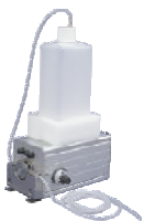
Art. No.: 35.005