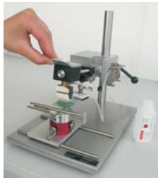
Art. No.: 56.073