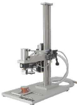
Art. No.: 56.075