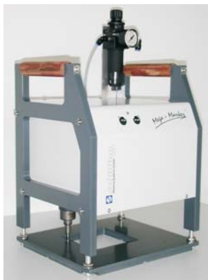
Portable Version (Optional) With handles and ground plate, incl. prism